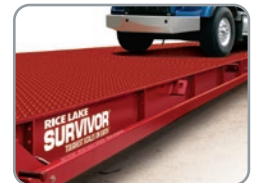
SURVIVOR ® ATV Heavy- and super-duty top access portables