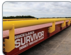
SURVIVOR ® OTR Top access, low profile concrete or steel deck scales