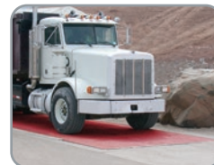
SURVIVOR ® PT Pit-type concrete or steel deck scales