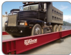
SURVIVOR ® SR Extreme-duty, low profile concrete or steel deck siderail scales