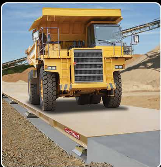
SUPERIOR STEEL STRENGTH FOR HEAVY-DUTY LOADS

The durable baked-on, anti-corrosion powder paint provides a long-lasting quality truck scale appearance for unmatched environmental protection.