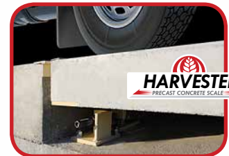
Harvester® Precast Concrete Truck Scales

Cardinal Scale reserves the right to improve, enhance or modify features and specifications without prior notice. All registered trademarks are the property of their respective owners.