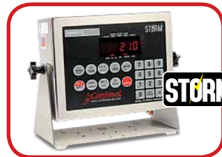
200 Series Weight Indicators