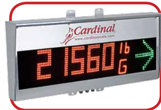
Large Readout Remote Displays