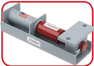
AGBAR Load Cell Assemblies